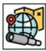
Geographical Skills and Fieldwork